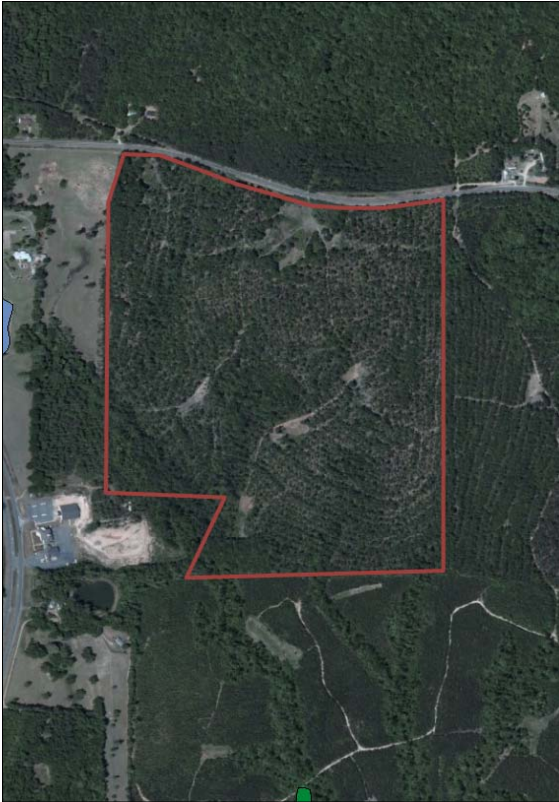
Wetlands identified in green/blue shading