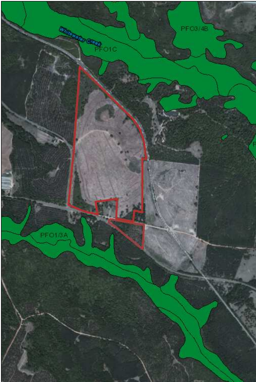
Per NWI-Wetlands indicated in blue/green shading